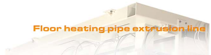
Floor heating pipe extrusion line